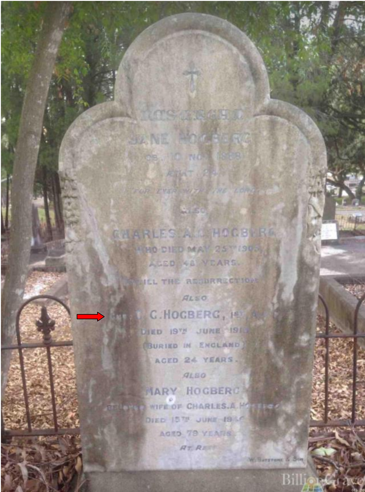
Hogberg Family Headstone