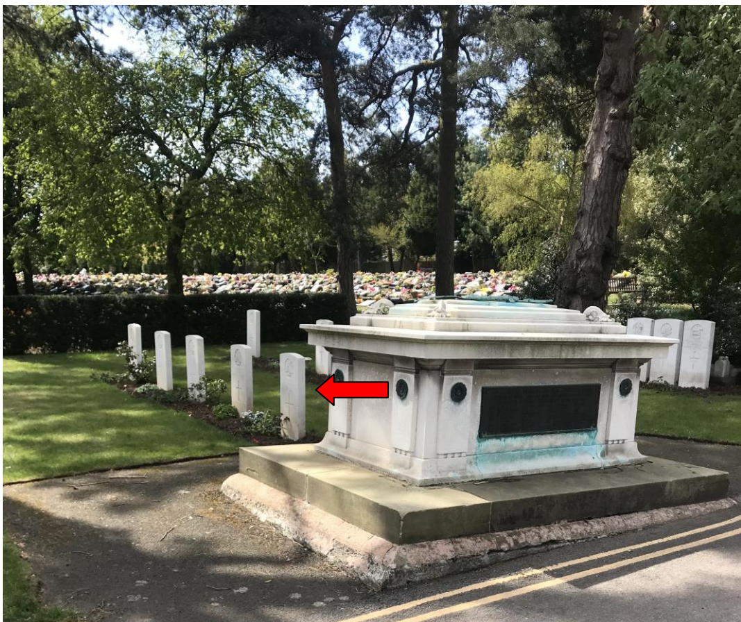
Arrow showing the Plot where Australian WW1 War Graves are located